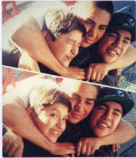
Our boys figure out ways to sneak in friendly ways to wrestle with each other (without getting in trouble). Sometimes, they are too cute not to photograph.