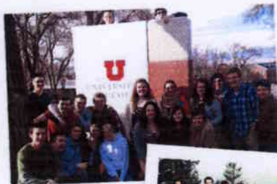
Left: MSU Cru students sharing Christ in Salt Lake City on the college campuses and serving the local community.