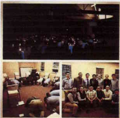
Above: Our Vision Night where 95 students are commissioned to pray for and invest in the next generation of students.