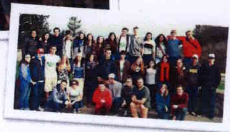
Left: MSU Bobcats serving the local Cru movement and the homeless of Portland, OR.