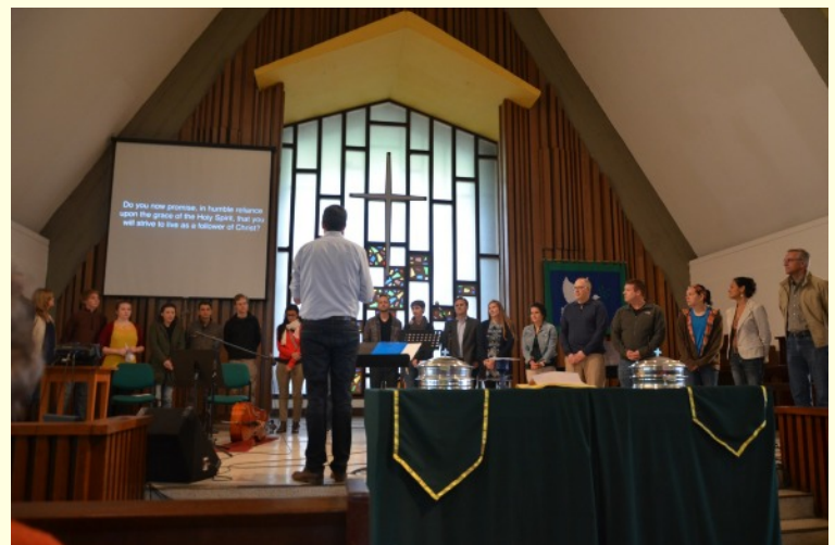
We welcomed new members in February! Join us in praising God for the incredibly rapid growth UCB has experienced over the last 6 months.