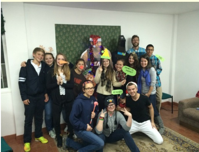
Members of our high school youth group goofing off at our annual Christmas party. LeBron James showed up for the white elephant exchange.